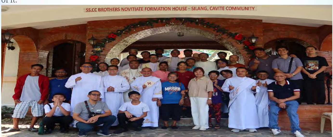
To all my dear brothers and sisters, my early wishing of solemnity of the Sacred Heart of Jesus, and let's remember each other in our personal and community prayers.