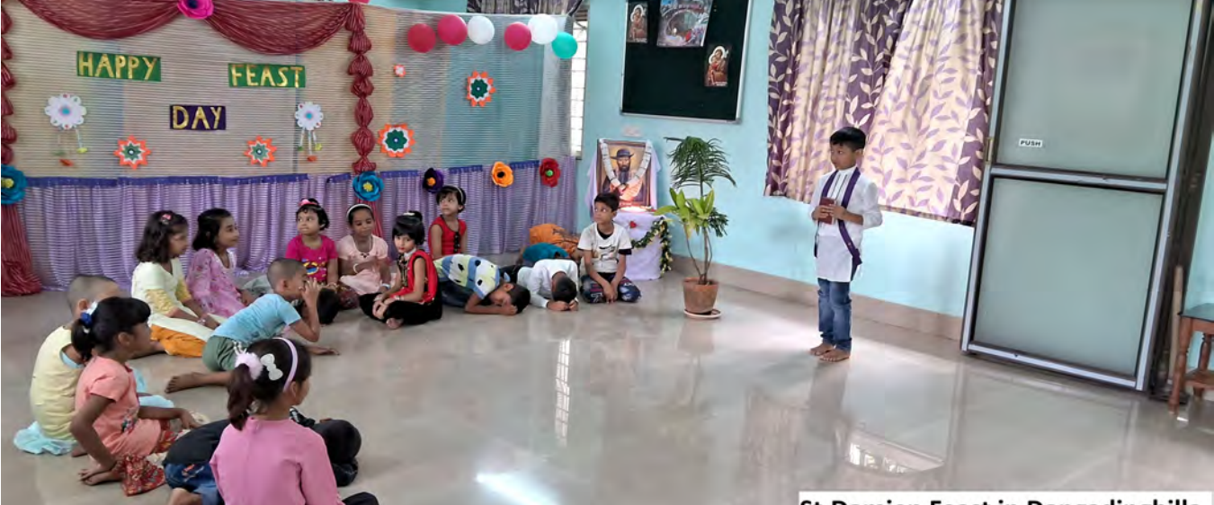
St.Damien Feast in Dangadinghilla.